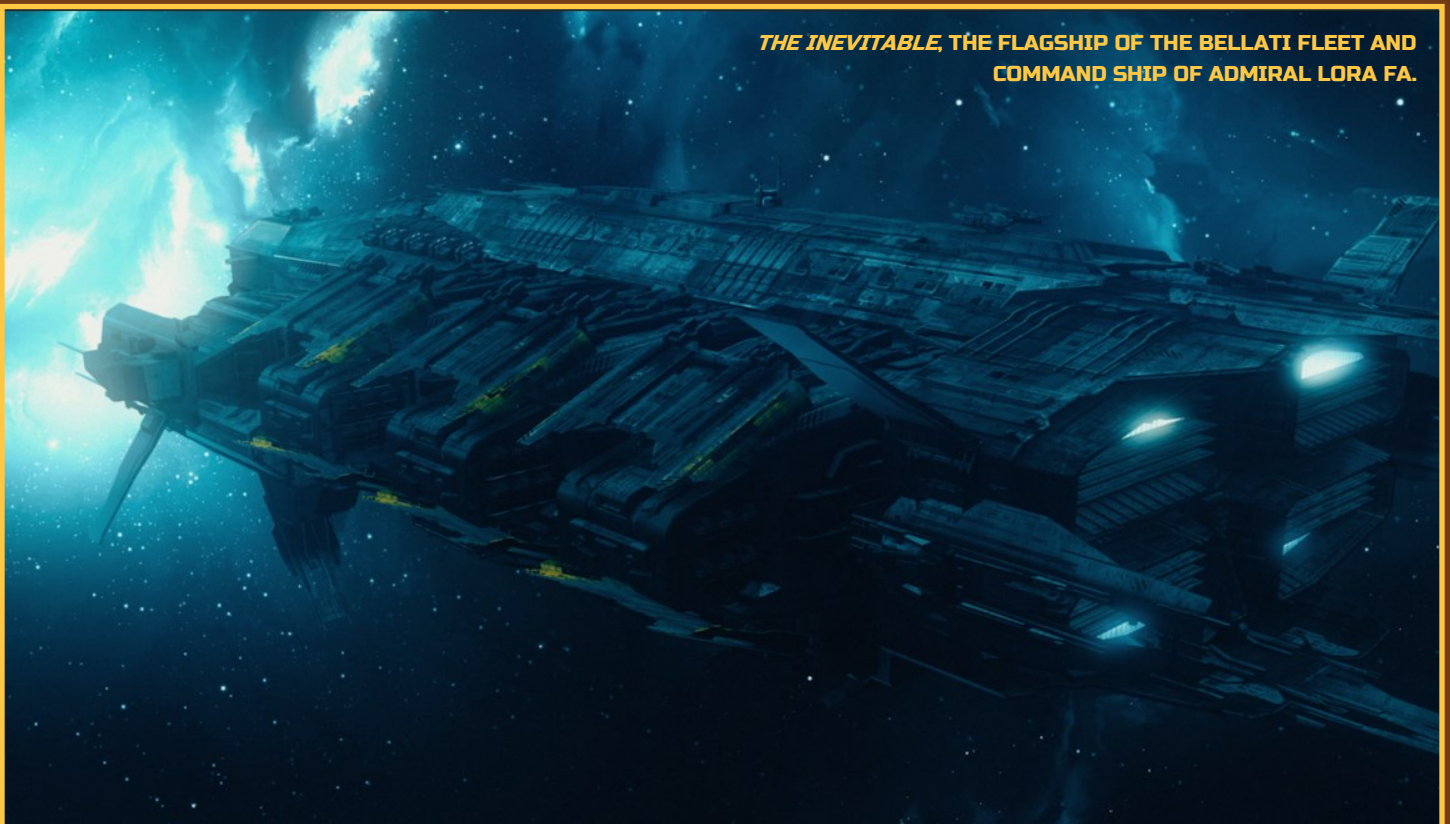
THE INEVITABLE, THE FLAGSHIP OF THE BELLATI FLEET AND COMMAND SHIP OF ADMIRAL LORA FA.

Yet as the opposing fleets began to move toward each other, The Inevitable stood its ground. While Dominari ships continued to accelerate, the Bellati vessels slowed to match the flagship. Moments later, all of the Bellati vessels began to fire their weapons. To the surprise of both sides, their missiles and plasma fire rained down on the closest Dominari vessels, destroying them