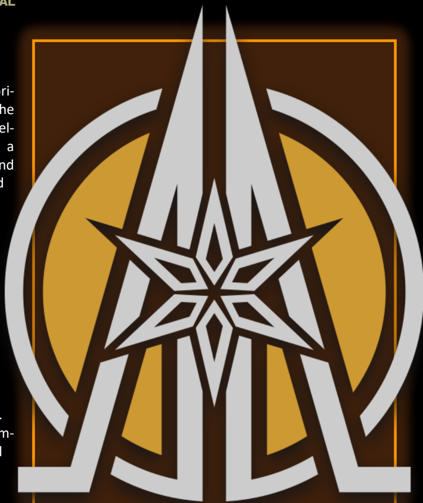
The new Official Crest of the United Sellonian Empire, as it has existed since 898.

The year is 923 OL, and Her Majesty Empress Laevinia IV rules over the Sellonian Empire.