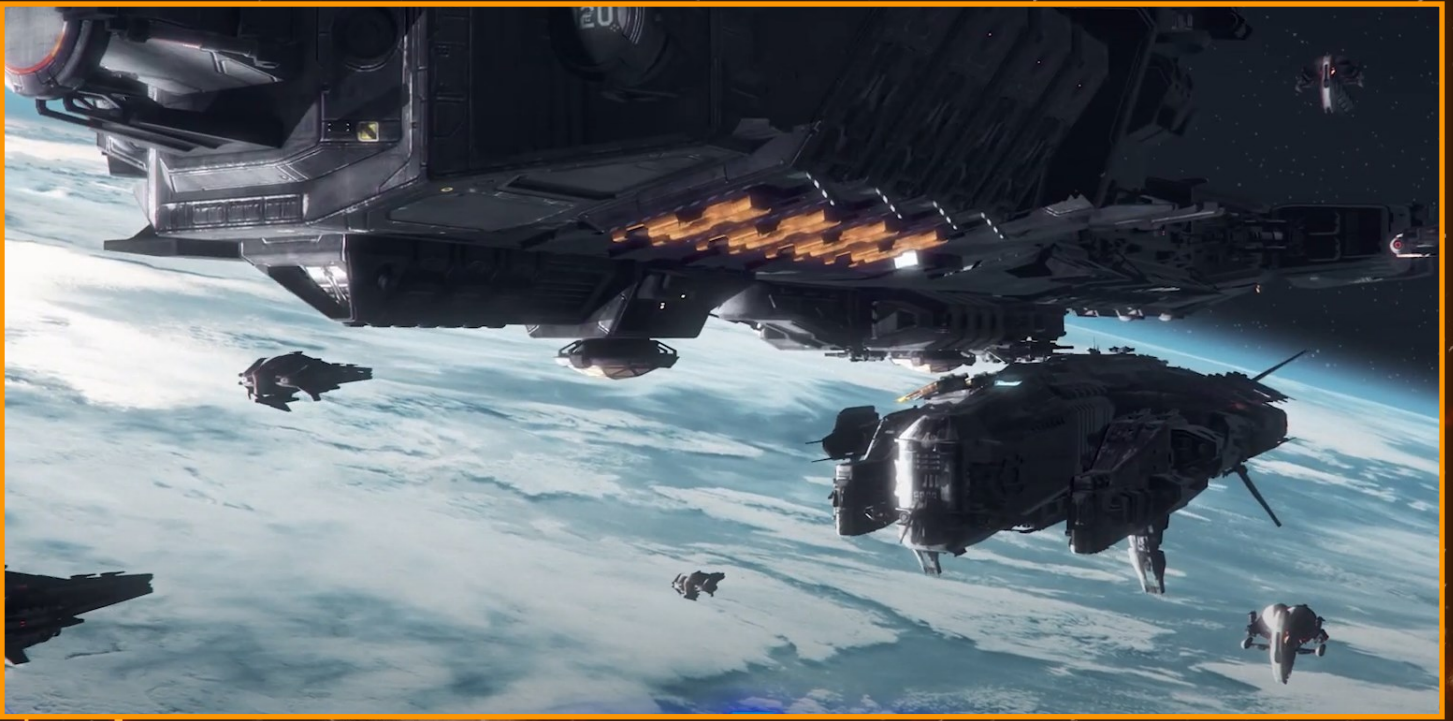
THE WARSHIPS OF THE HUMAN, VYXIAN, AND RIKKAN ARMADAS ASSEMBLE OVER YARUT BEFORE BEGINNING THE FAMED ORBITAL BOMBARDMENT THAT WOULD ELIMINATE AN ENTIRE SPECIES.

In the wake of such wanton destruction, an enclave of Khi'Hinnese monks retreated into a period of H'ar, a sacred time of physical withdrawal for research and reflection. Hoping to avoid the terrors of the past, the monks cried out to the universe for a path to peace and enlightenment. The response would forever change the fate of the galaxy.